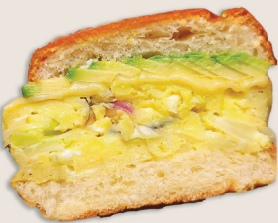
KOREAN STREET TOAST