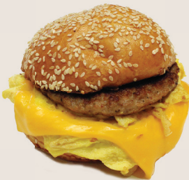
EGG & CHEESE W/ SAUSAGE ON BRIOCHE