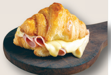
EGG & CHEESE W/ HAM ON CROISSANT